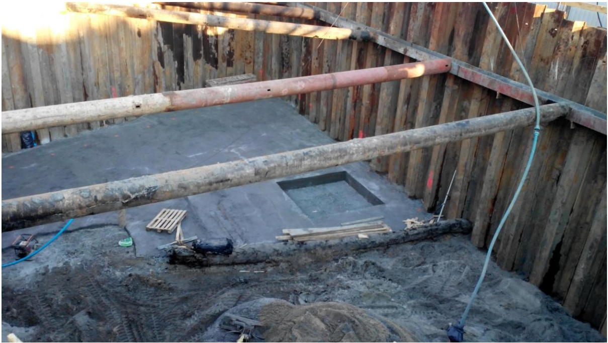
Fundament in civil house for 13 flats and 2 flors of underground parking