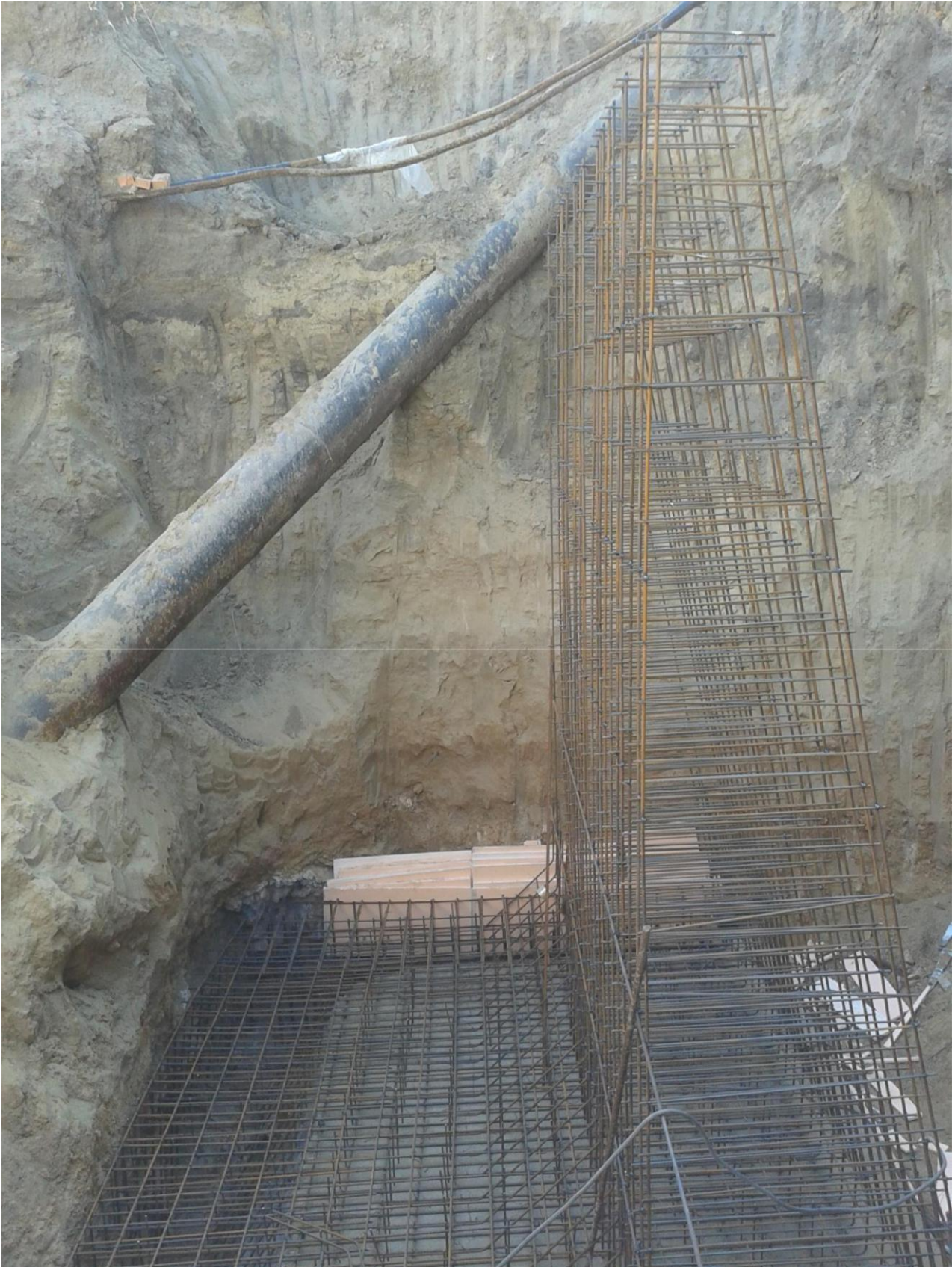
Supporting wall Dnipropetrovs Ukraine 2012.

Work in which I was directly involved. In particular binding fittings assembly with subsequent concreting formwork.