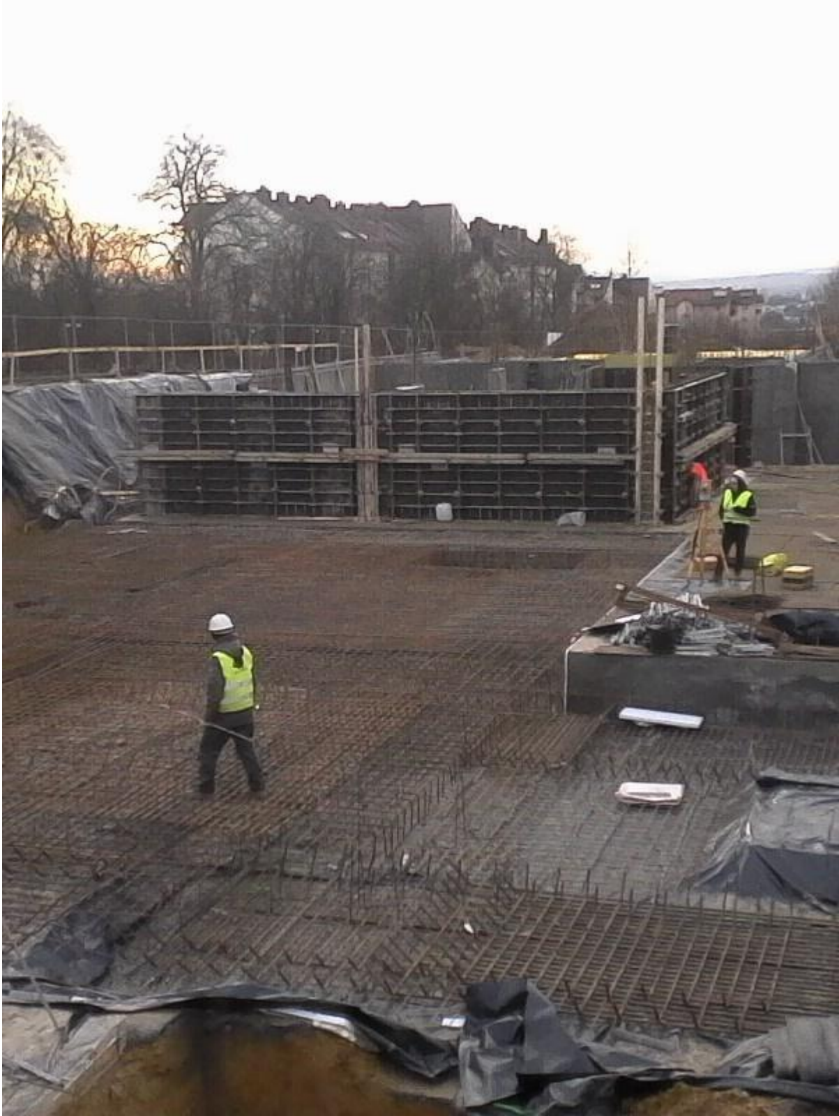
Civil 5 floors building with underground parking in Krakow POLAND