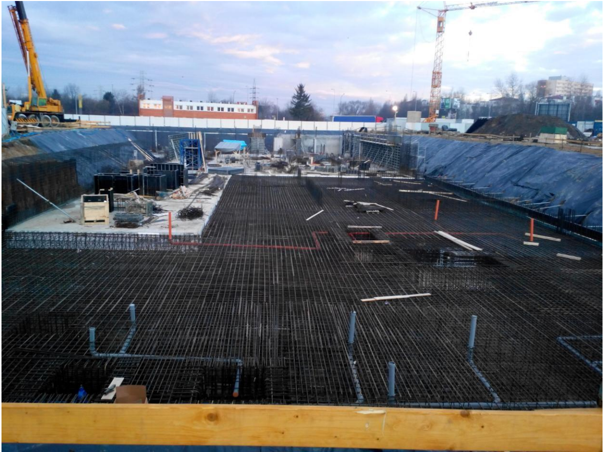
11 flour civil building