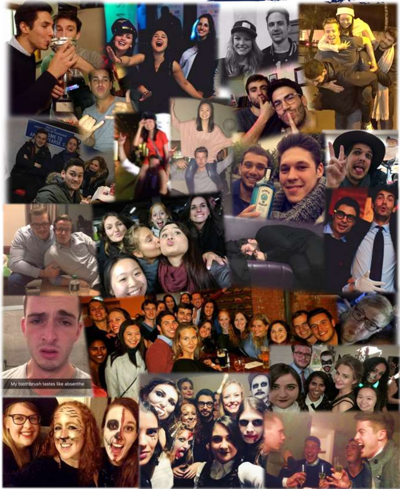
My toothbrush tastes like absinthe